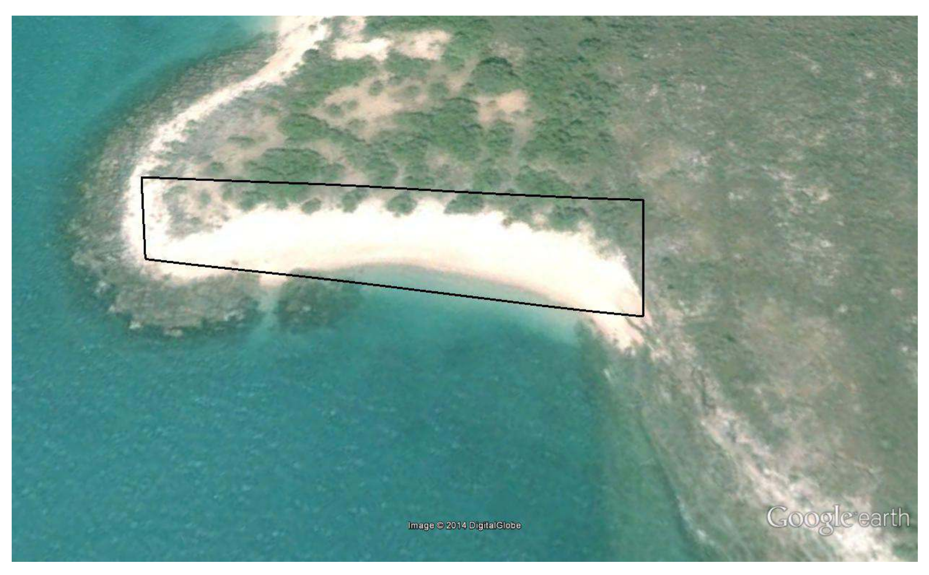
Figure 1. Extent of ocular and metal detector surveys of the beach (current google earth image of the beach).