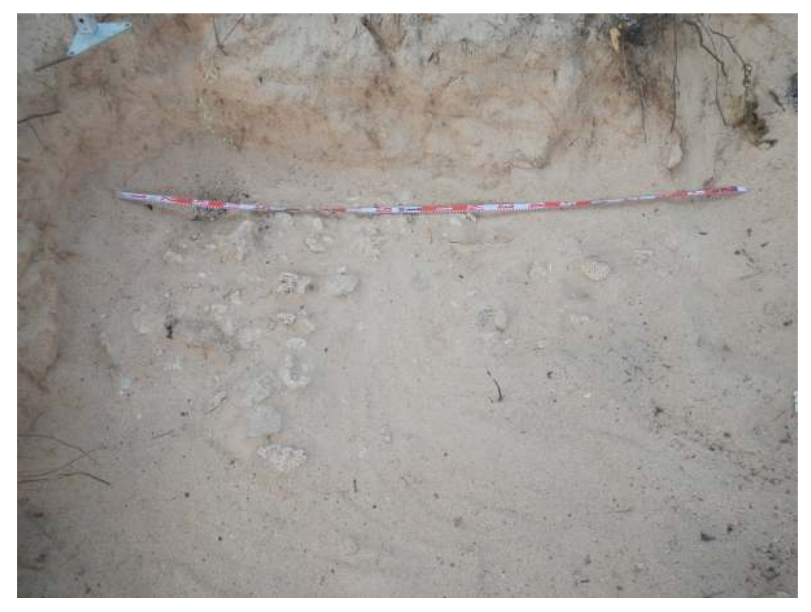
Figure 4. Coral rock feature in the southern end of Trench 5.