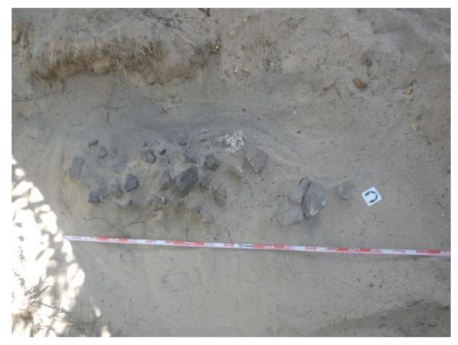
Figure 5. Rocky feature in Trench 3a. While resembling a grave feature it was subsequently found to be a naturally occurring feature.