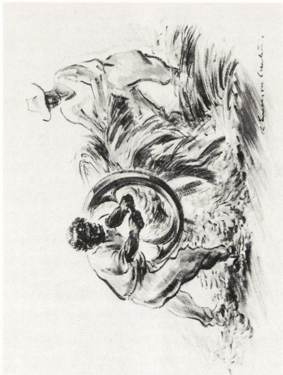
Plate 2. R. Emerson Curtis, The chaff cutters, Gunnawurra , 1945 (AWM, watercolour and lithographic crayon with pencil, 30.4 x 35.7 cm; 25608).